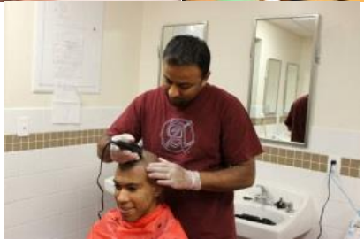
North East Regional Youth Fellowship - NYC Rescue Mission