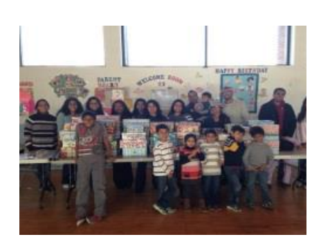
Long Island MTC Young Family Fellowship's Operation Christmas Child project.