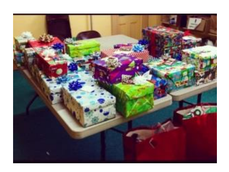
St Thomas MTC Yonkers NY -Operation Toys for Kids